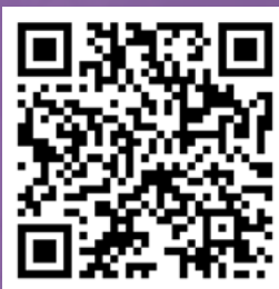
BBC Bitesize History

Use online revision tools like BBC Bitesize at home to improve your history knowledge even more.