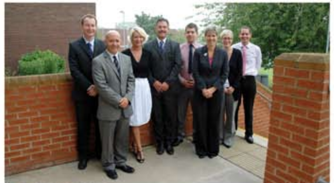
The Senior Leadership Team

This is a good school with outstanding features and it is improving rapidly.