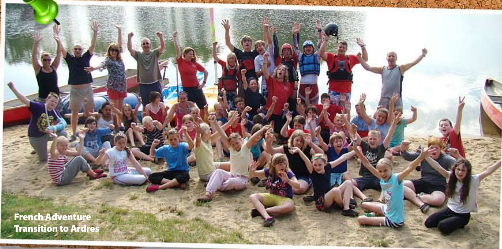
French Adventure Transition to Ardres

Just like every year, the year 6 pupils from our partnership primary schools are offered the opportunity to go to France. This year they stayed in the lovely town of Ardres which is in Northern France. The children had an absolutely fabulous time participating in a wide range of outdoor activities and making new friends.